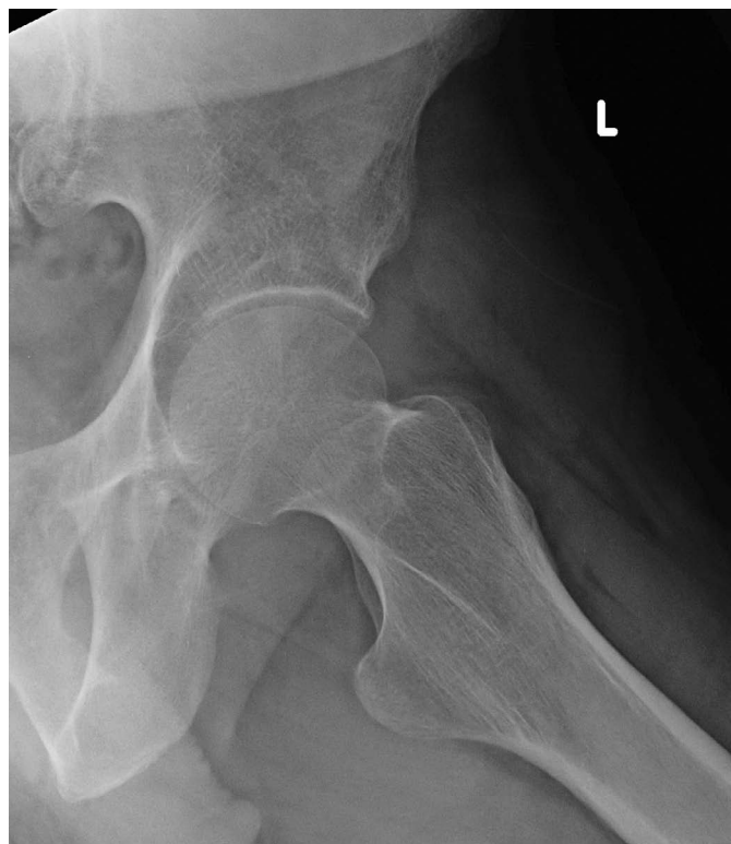
Figure 1. Anteroposterior (A) and frog-leg lateral (B) radiographs reveal normal bone density, trabeculae and only minor hip joint space narrowing.