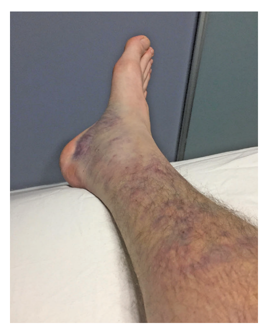
Figure 2. Lower leg bruising present five days after trauma.

A 34 year-old male presented to a chiropractic clinic with right knee pain and bruising of the inferomedial aspect of their thigh and lower leg. The patient had not seen a