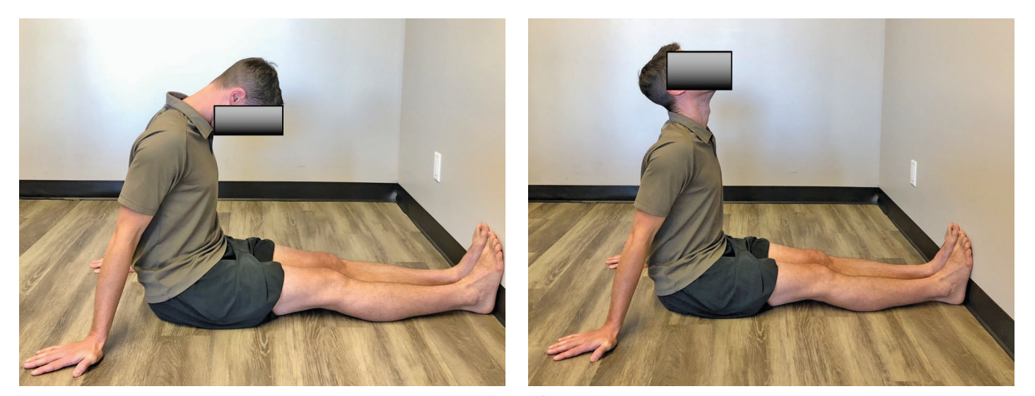
Figure 3. Retlouping exercise .

The patient presented to the chiropractor for their second follow up visit at seven weeks post-injury and four weeks post-aspiration, and reported no pain in the knee with day-to-day activity and had now attempted jogging, the elliptical machine, lunging, and squats successfully without pain. A LEFS score of 68/80 was recorded. The chiropractor again used soft tissue techniques including manual therapy and a FAT tool to reduce tension in the hip